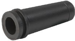
4311.0064 PVC Strain Relief