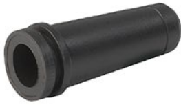
4311.0063 PVC Strain Relief