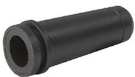
HN 14.109 PVC Strain Relief