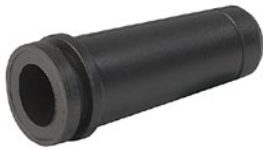
4311.9301 PVC Strain Relief